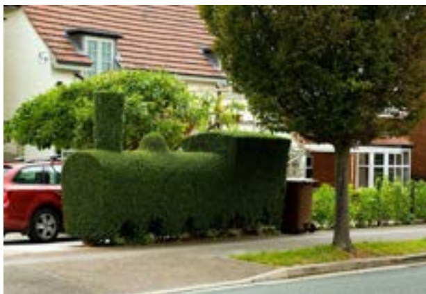
Shrub model locomotive