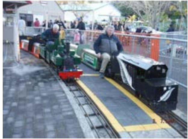
Waiting for the first load of passengers.

NOTE: Matariki is also known elsewhere as the Pliades or Seven Sisters. In Japan it is known as Subaru, and you will see the constellation on the front of Subaru cars.