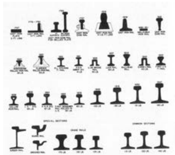
FIGURE 6. Sketches of cross-sections of rail from the earliest periods of railroading until the present, showing the evolution of the modern railroad rail design.

If I have missed any out, kindly advise me of whom and their details.