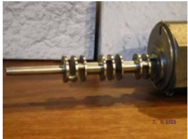
Jig for cutting offset crankshaft journals.