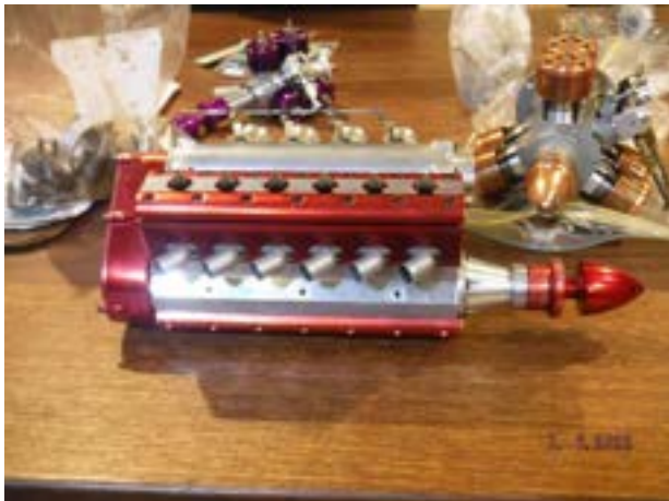
V-12 supercharged engine