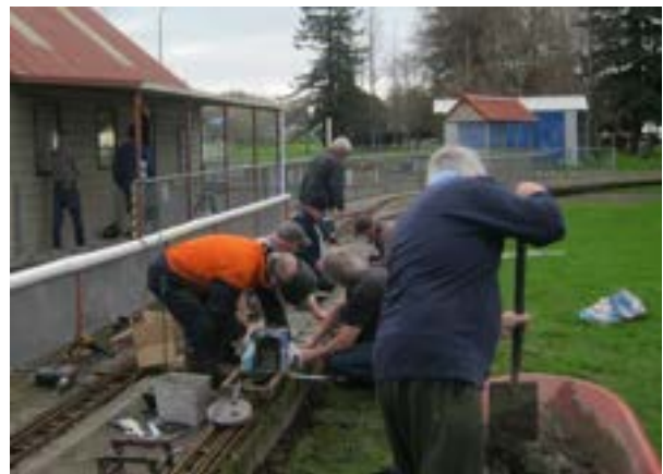
All hands on deck