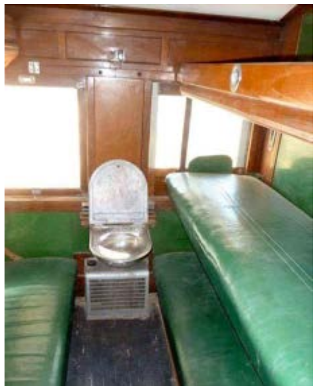
A South African Rail six-person compartment showing the bunk bed arrangement and washbasin.

Fond memories by yours truly sleeping overnight on the moving train. The top bunk was my preference, as you could lie up there all day reading if you preferred.