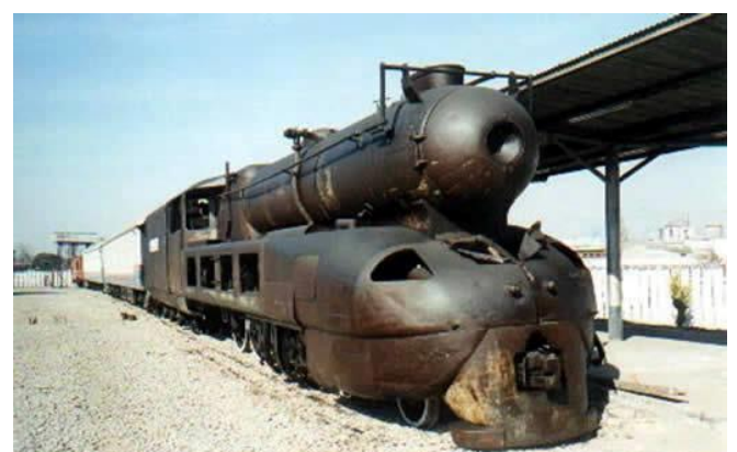
“La Argentina” a metre gauge, a 4-8-0 4 cylinder compound loco