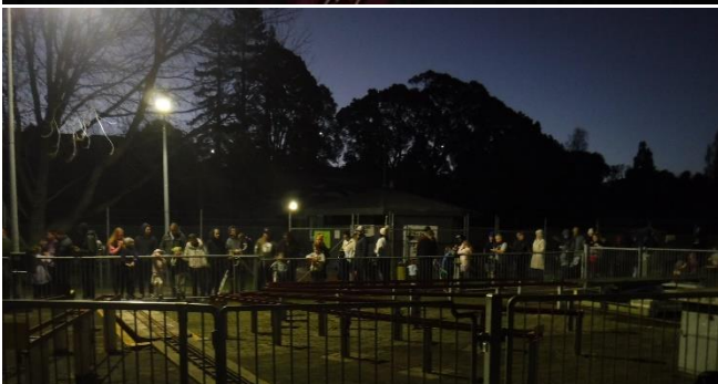
The rapidly forming queue.