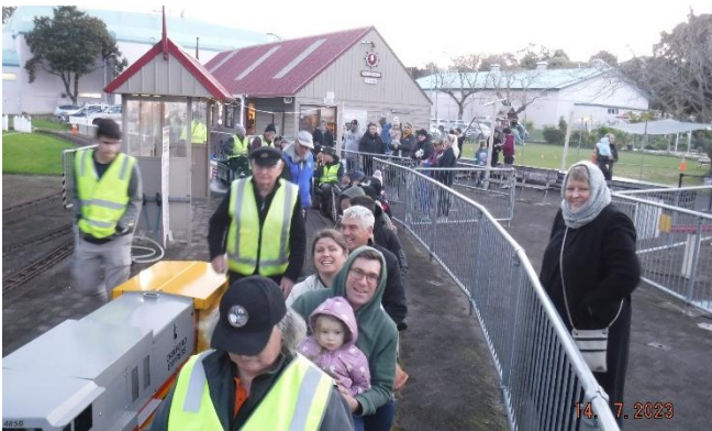
Early start before the crowd arrived.