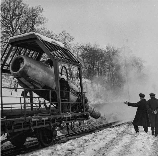
Czech rail snow blower