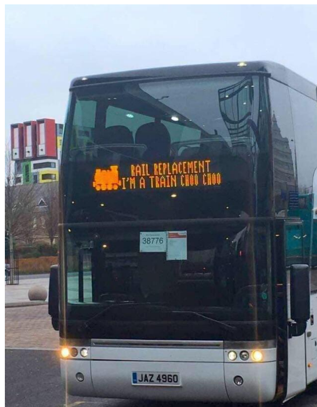
I'm a choo choo