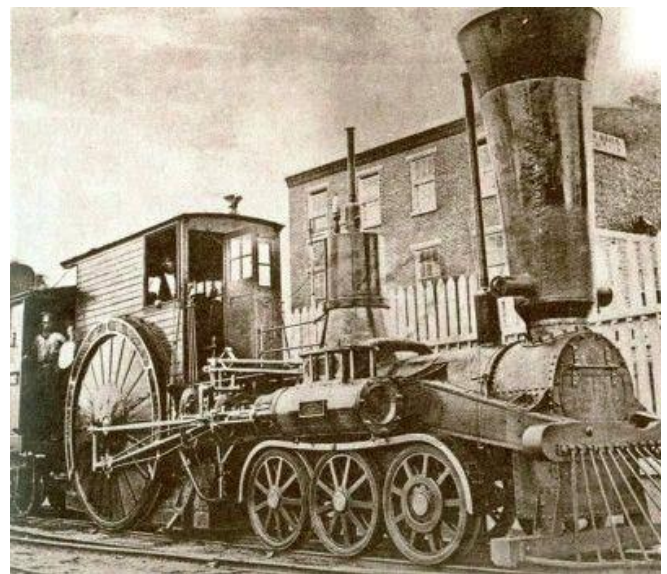
Camden & Amboy 6-2-0 Lightning