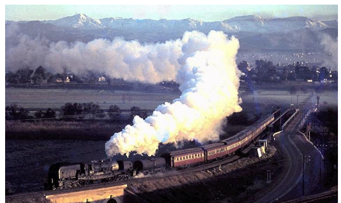
A SAR Garrett in the Western Cape