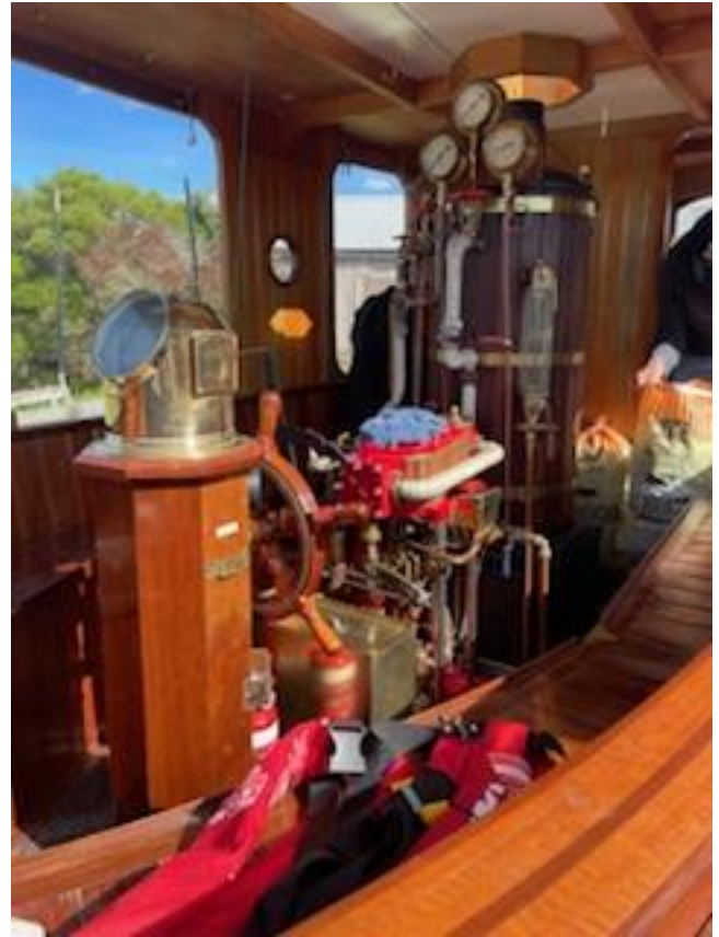
Some nice boat details.