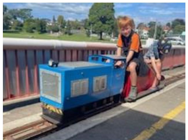
Future loco engineer