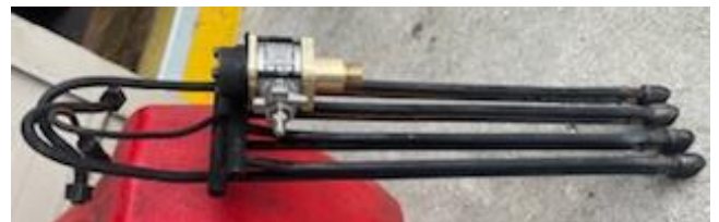
The offending superheater.

Christchurch Live Steamers - www.clstrains.co.nz Canterbury Society of Model Engineers -