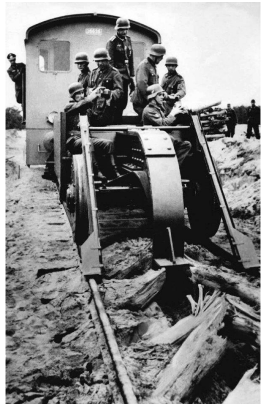
WW2 German rail sleeper ripping.