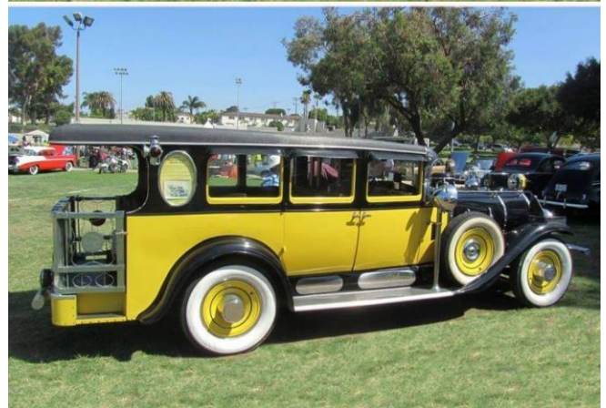
The 1929 Graham Paige Choo-Choo custom.

Here is a very interesting mechanism. It must have been a highly inventive mind just to come up with the concept. I could watch it all day!